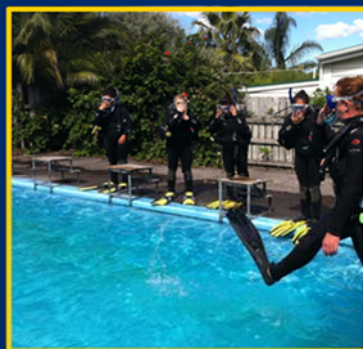
Respect for Learning