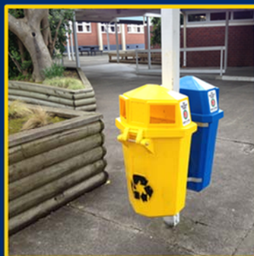
Respect for Environment