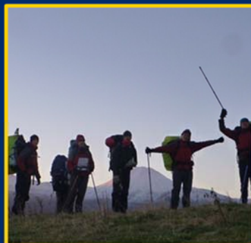
Respect for Others