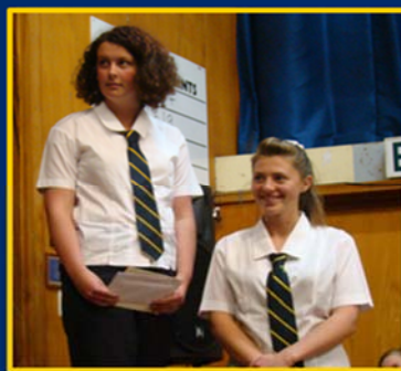
Respect for Self